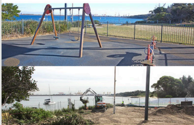
Revitalising the playground area for Randwick City Council.

Based on achieving this target they sort to establish a solution to protect the environment through a recycling process.