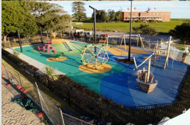
The finished project, completed in August 2020.

Complying with Australian Standards, Synthetic Grass & Rubber have developed a waste reduction process for old wet pour rubber playgrounds. This process consists of removing the old rubber wet pour from the existing playground and returned to their plant. It is then processed through innovative machinery which granulates the rubber and then coloured as required. This recycled material is then used in the new playground as the base course rubber.